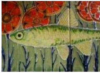
Susanna Giller's amazing tile work

You'll find everything from pottery and planters, to lovely jewelry from Goyne Vintage (her gorgeous pieces include old chandelier crystals, skeleton keys, antique brooches, and clock parts). We have steampunk lamps made from old coils, insulators, and other industrial parts.